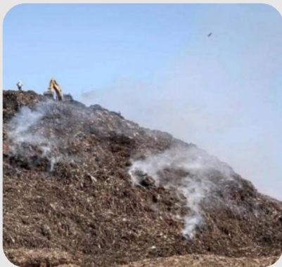
Gas emissions and pollutant transport through soil in landfill environments (Press photo).